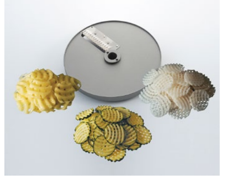
Gaufrettes (PG) PG4 4 mm PG8 8 mm