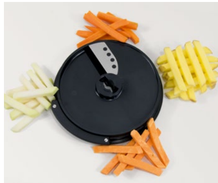
French fries cutter (PF)