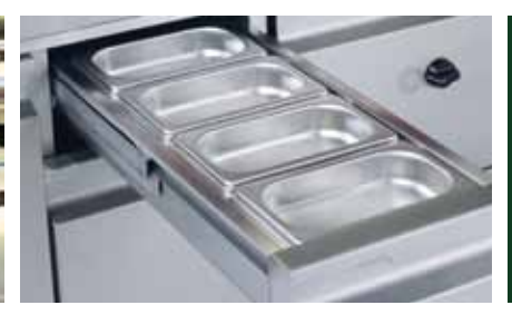
Highly functional handling