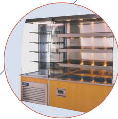
Equateur / Inouk : hot or chilled upright displays