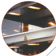
Design and performance