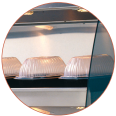
Holding temperature Vauconsant