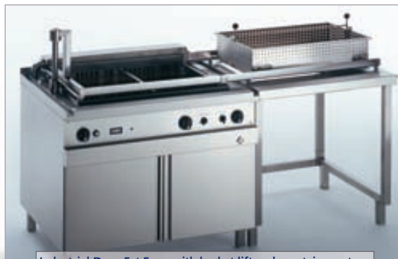
Industrial Deep Fat Fryer with basket lift and emptying system