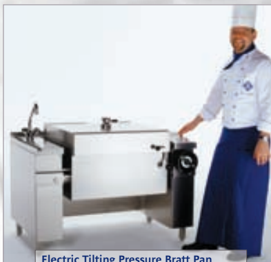
Electric Tilting Pressure Bratt Pan OptimaExpress 2/1 GN - manual tilting